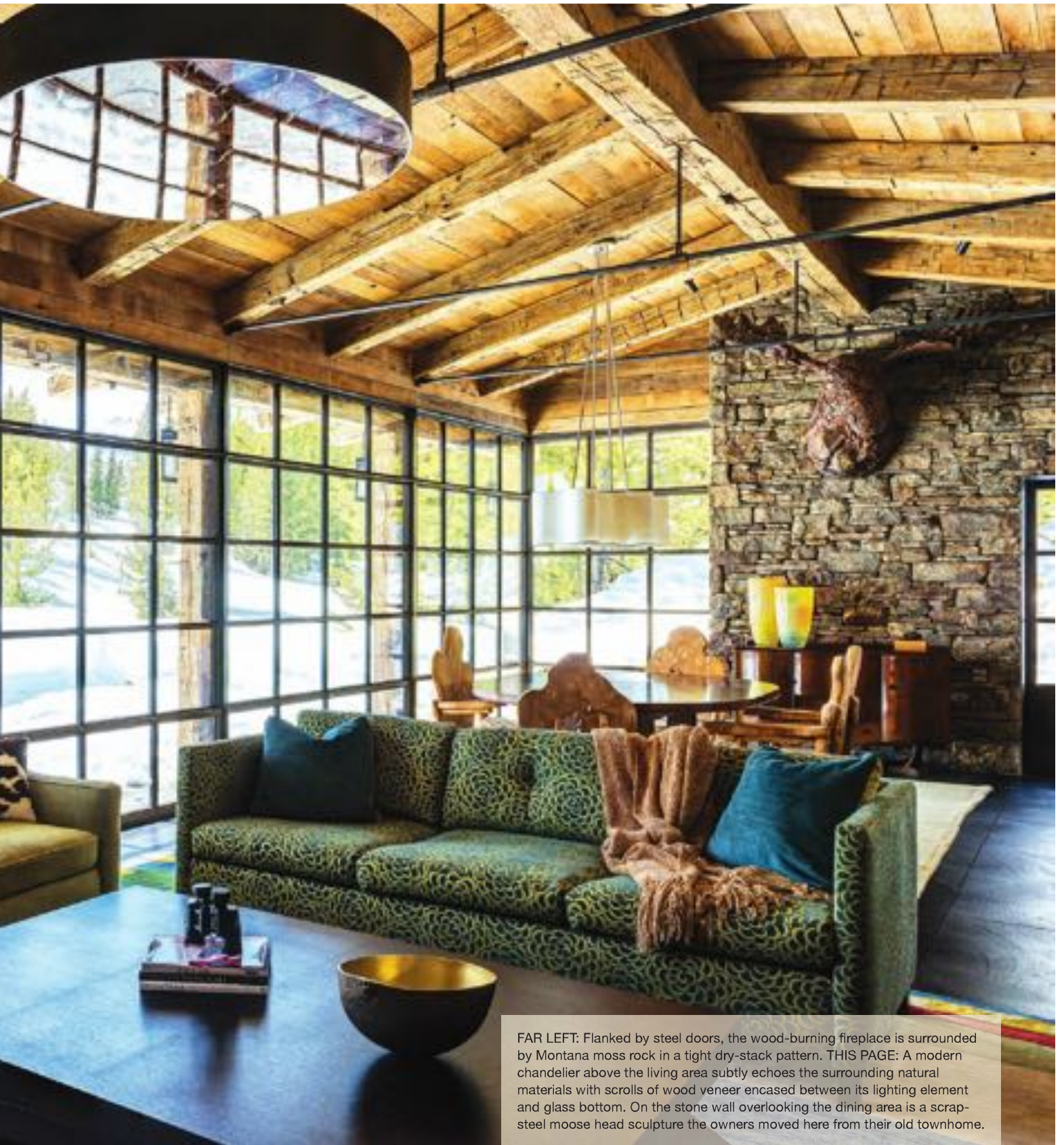
FAR LEFT: Flanked by steel doors, the wood-burning fireplace is surrounded by Montana moss rock in a tight dry-stack pattern. THIS PAGE: A modern chandelier above the living area subtly echoes the surrounding natural materials with scrolls of wood veneer encased between its lighting element and glass bottom. On the stone wall overlooking the dining area is a scrap-steel moose head sculpture the owners moved here from their old townhome.