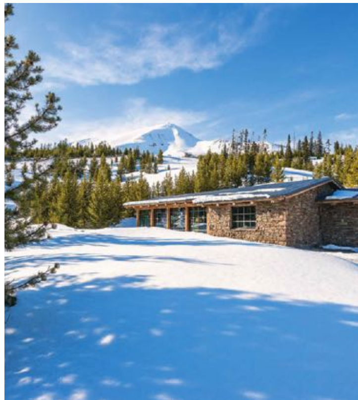
FACING PAGE: The guest bathroom’s ceiling is covered with a “log cloud” composed of random-length sections cut from fallen lodgepole pines on the property, into which are recessed eight LED lights. Wood-grained porcelain tiles, oak cabinets, a steel countertop and antique-style brass faucets enhance the rustic-meets-modern aesthetic. ABOVE, LEFT: A custom chandelier composed of coarse fibers adds a soft, wild touch to the master bedroom’s clean lines. ABOVE, RIGHT: Viewed from across its adjacent meadow, the cabin tucks cozily into a stand of trees and a nearby hillside.